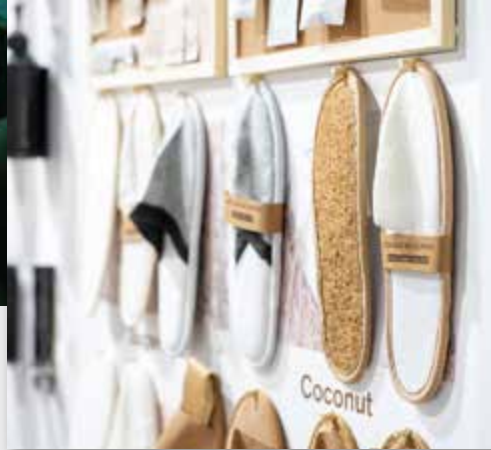
WELLNESS AND RECREATION